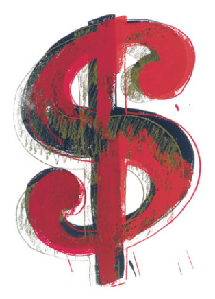
Dollar Sign, 1981